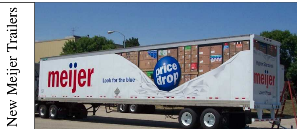
New Meijer Trailers